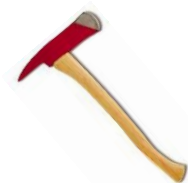
PICK HEAD AXE